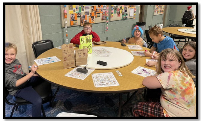
you to our illustrious JAM team for helping to make this a success!

members and friends enjoyed the readings and beautiful singing. Thank